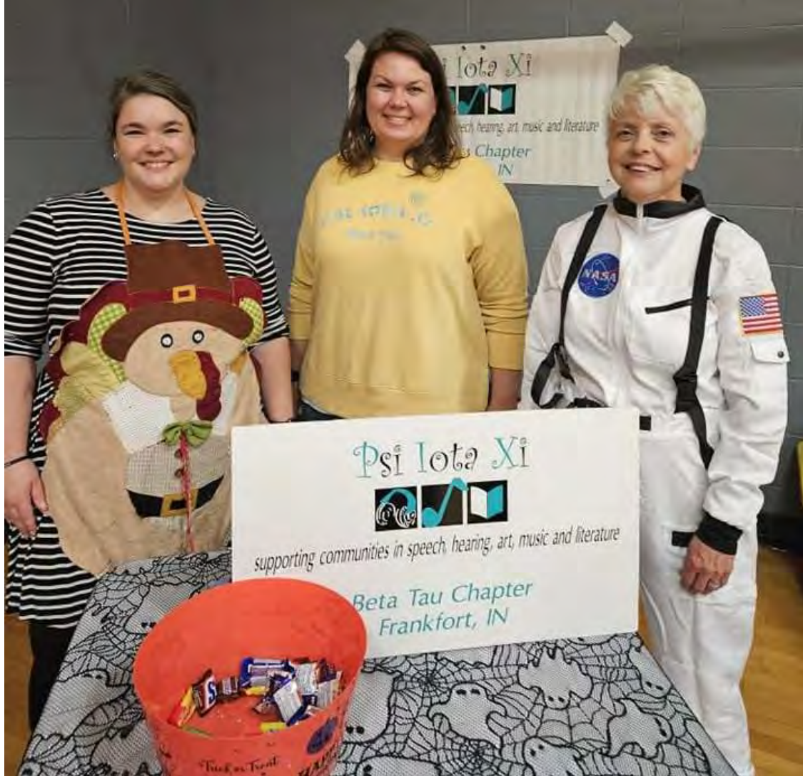
Beta Tau Frankfort IN, handing out candy at the C.O.R.E. Community Center.