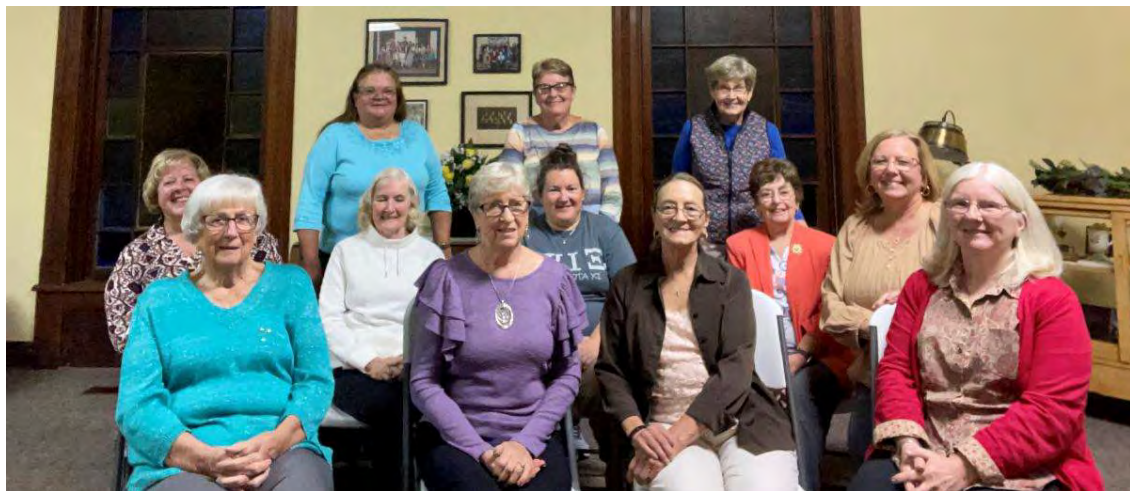
Theta Iota Monticello IN, anniversary gathering.