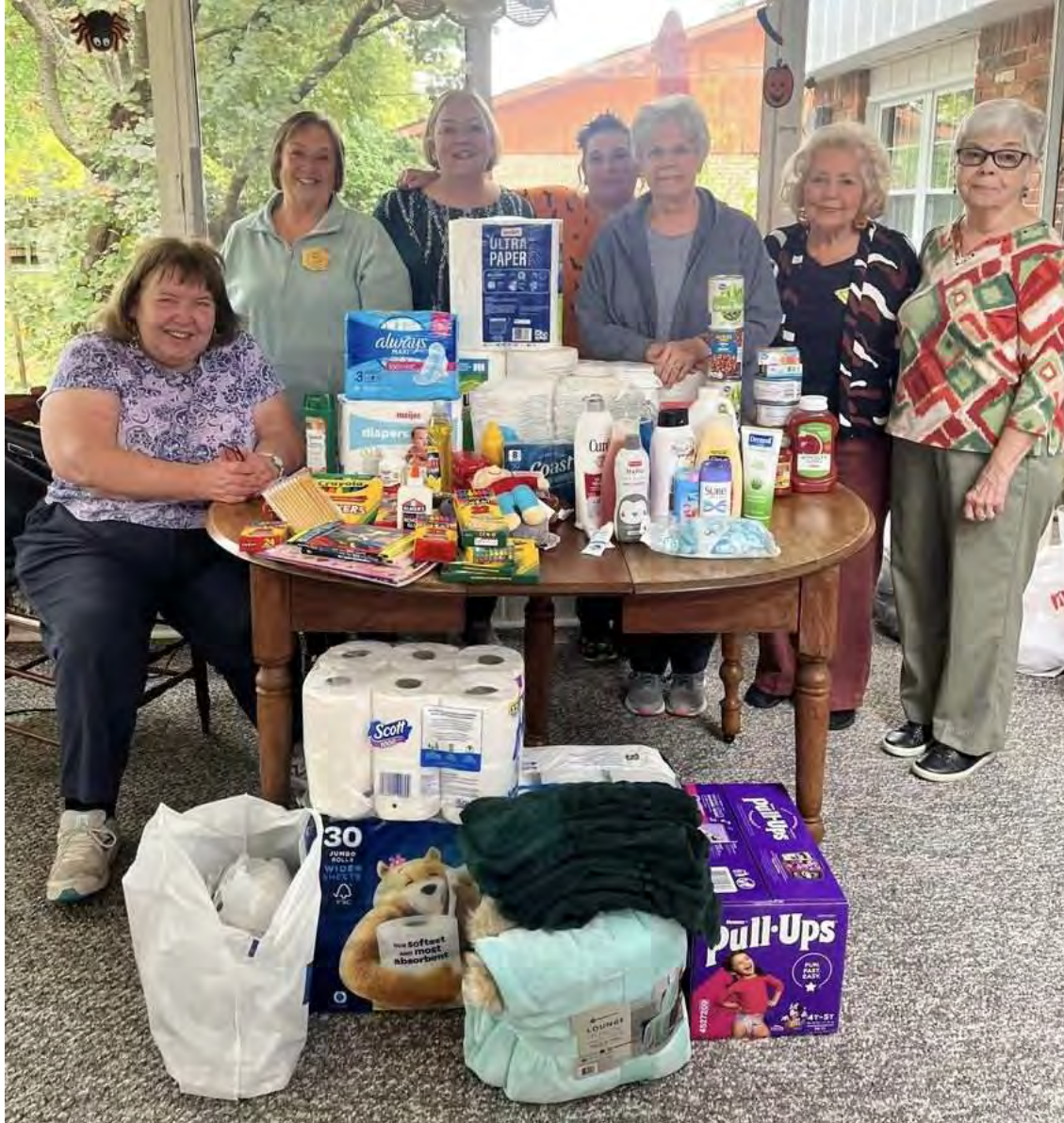
Iota Tau Indianapolis IN, collection for Holy Family Shelter.