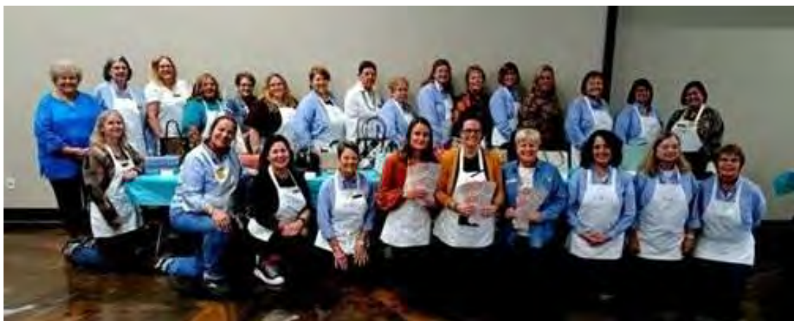
The Rho Chapter of Psi Iota Xi Sorority held its 3 rd Annual Purse Bingo Fundraiser on

Complete Holiday Hours through December 16th! Wednesdays Nov. 29, Dec. 6 & 13 from 10-2 Thursdays Nov. 30, Dec. 7 & 14 from 10-2 Fridays Dec. 1, 8 & 15 from 10-2 Saturdays Dec. 2, 9 & 16 from 10:00-1:00 PM