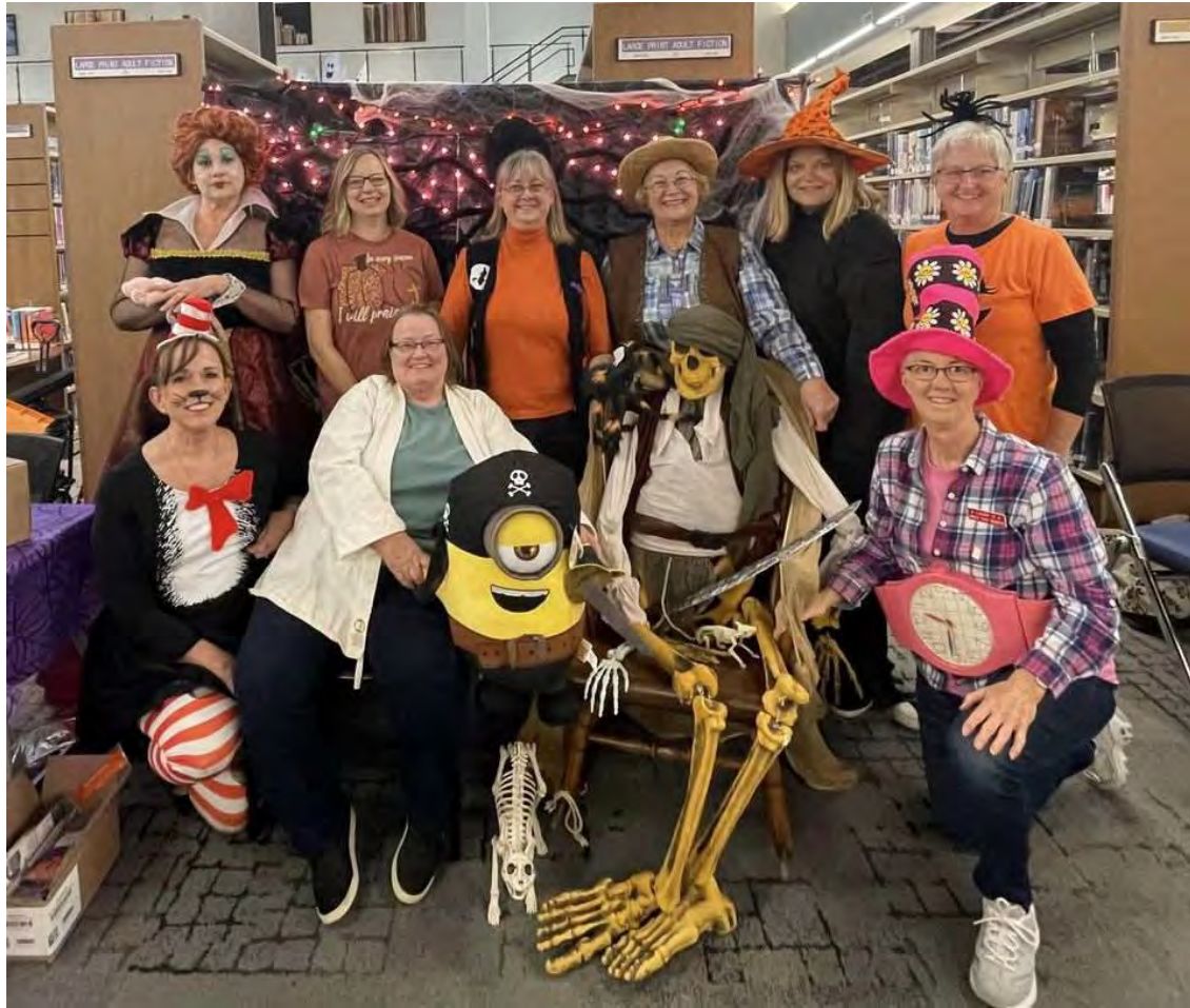
Zeta Mu Jasper IN, Library Halloween Bash

Sunday, October 8 th , at the Steuben County Event Center. The event was sold-out. In the past year, the money raised has included support for HEAR Indiana, Steuben County Health Clinic, Fort Wayne Philharmonic Fourth of July concert, Fremont High School Band and Steuben County Historical Society.