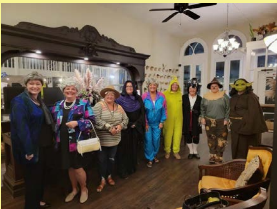
Beta Psi, Delphi, IN dressed up in costumes .

Charlestown Police Department was very appreciative to the Charlestown based PSI IOTA XI Sorority for their recent donation to our K9 Division and long time support of not only our department but the entire community. Shown accepting the donation