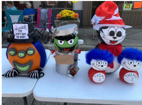
Iota Rho, Odon, IN hosted a pumpkin decorating contest during the Odon Fall Festival. Pictured are the winners.