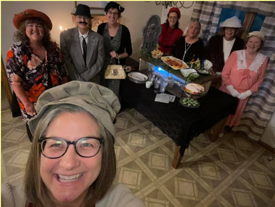
Theta Delta Bremen Murder Mystery party